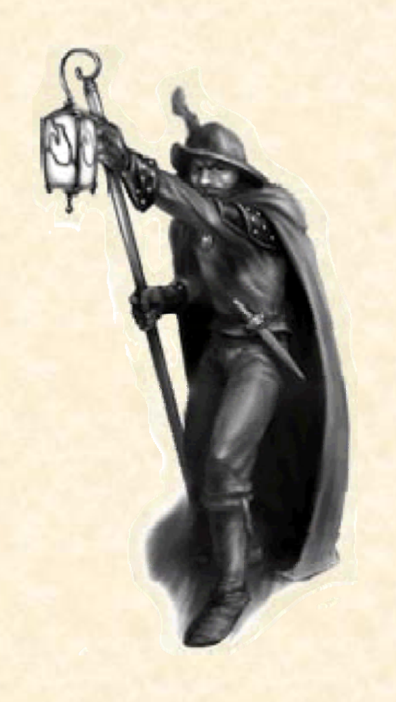
A Brief Examination of Old World Watchmen